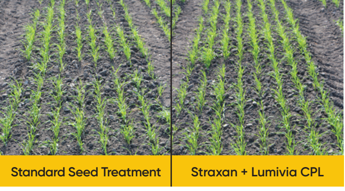
Osler, SK June 2023