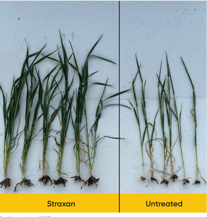
St. Albert, June 2023

Straxan increases plant count and stand establishment, maximizing the potential of your cereal crop.