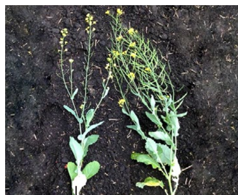
RT73 - 0.5 REL/ac applied sequentially at 4 leaf and 1st flower (not a labeled application timing)