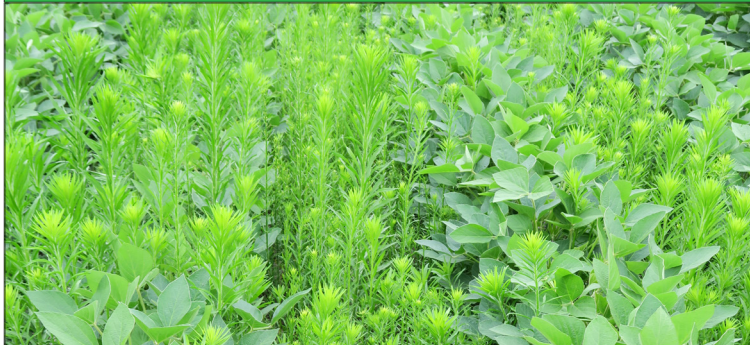
74 days after application